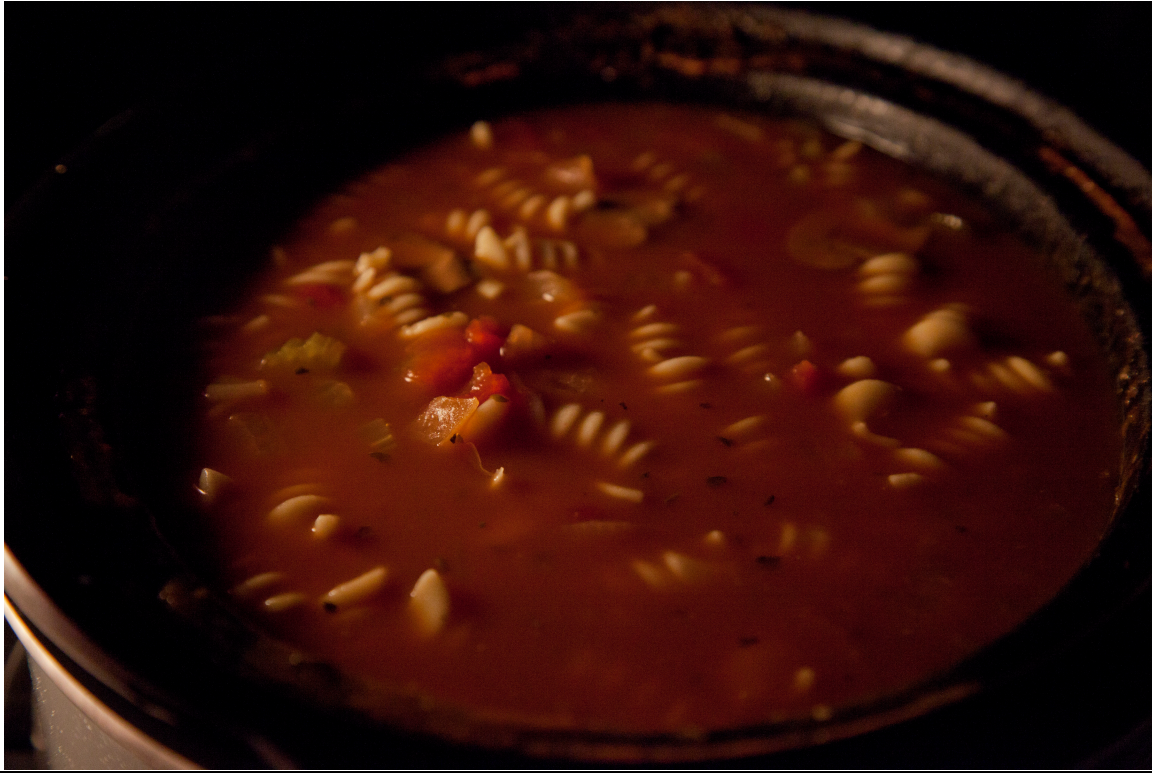
Minestrone Soup, page 37.