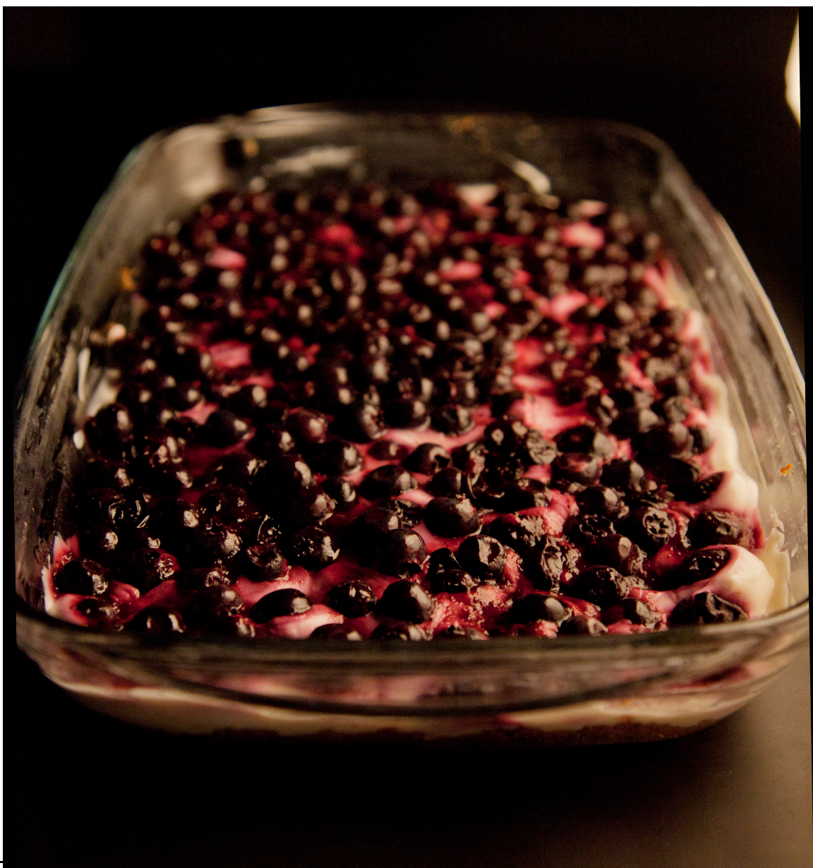
Blueberry Walnut Bars, page 57.