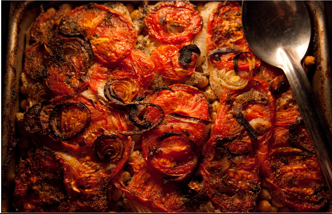
Baked Chickpeas, page 29.