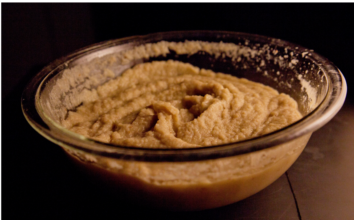
Baba Ghanoush, page 13.