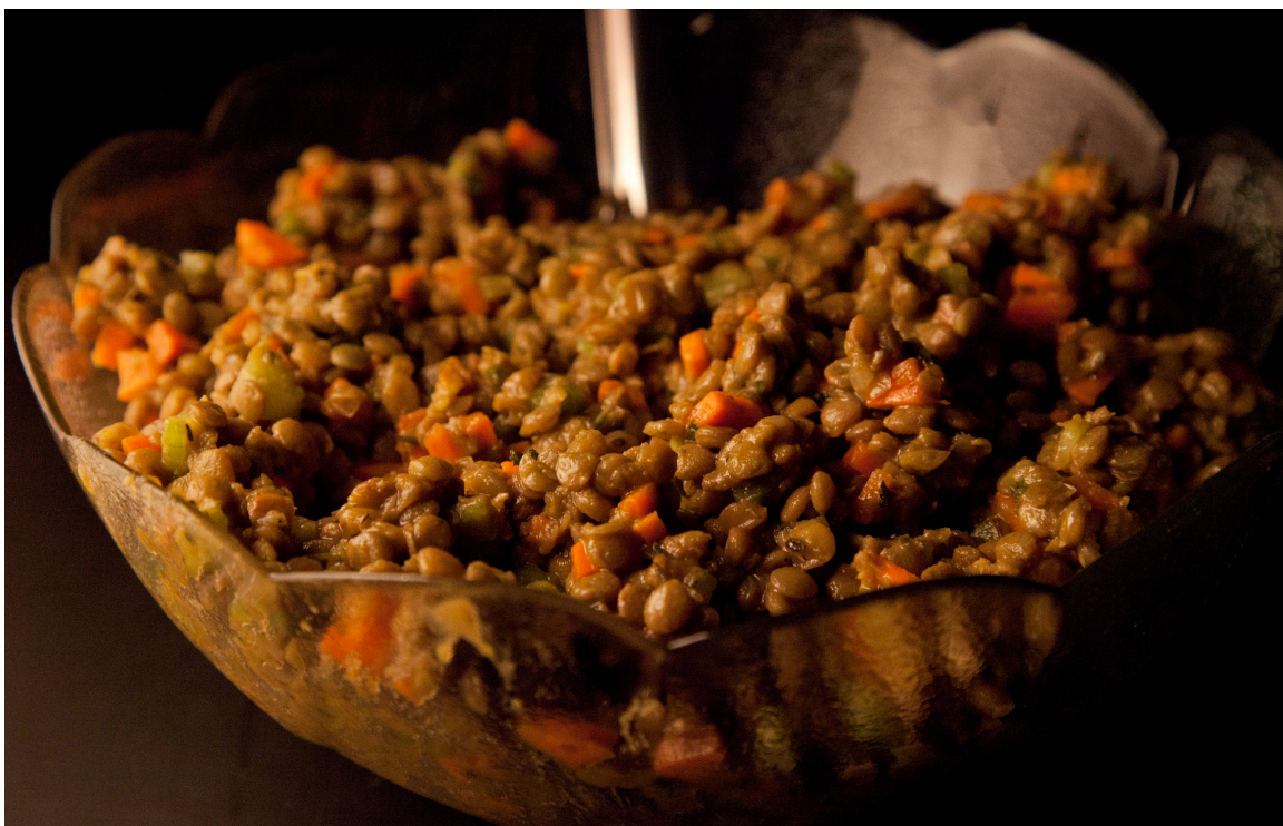
Lentil Salad with Goat Cheese, page 25.