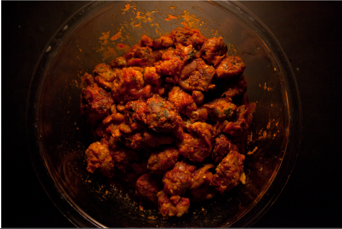
Meatballs with Eggplant, page 46.