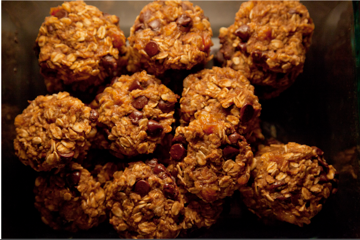
Banana cookies, page 58.